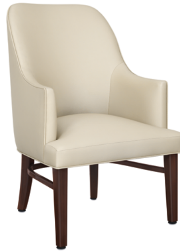
Model: CAM1 26W 27.5D 40H 20SW 19SD 19SH 26AH

A gently curved back and the fluidity of the arms and legs give the Camarina chair its great style and universal appeal. Piping along the chair base is standard. Camarina's peek-a-boo back opening prevents buildup of debris and facilitates simple housekeeping.